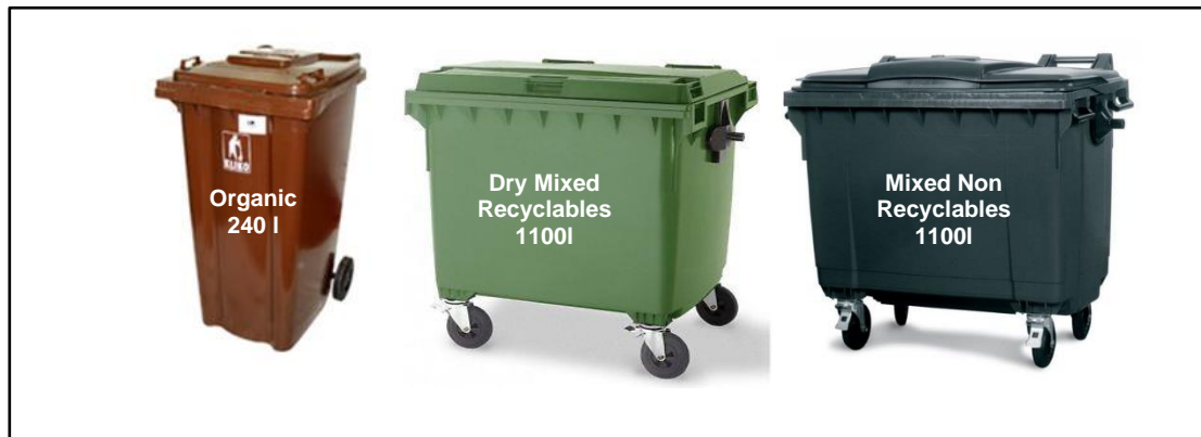
Figure 5.1 Typical waste receptacles of varying size (240L and 1100L)

The types of bins used will vary in size, design and colour dependent on the appointed waste contractor. However, examples of typical receptacles to be provided in the WSAs are shown in Figure 5.1. All waste receptacles used will comply with the IS EN 840 2012 standard for performance requirements of mobile waste containers, where appropriate.